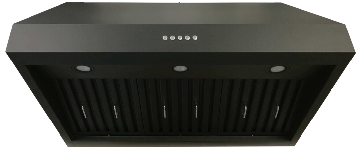
36" Matte Black