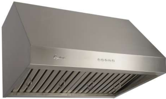
30" Stainless Steel